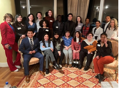
Dinner with ND and NYU AnBryce scholars