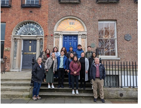
Cohort 10 and staff at ND Global Gateway's, O'Connell House in Dublin