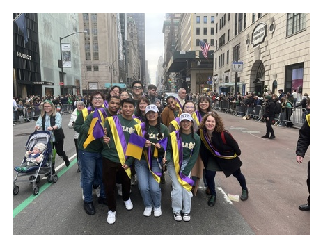
Represeniting County Wexford at the St Patrick's Day Parade