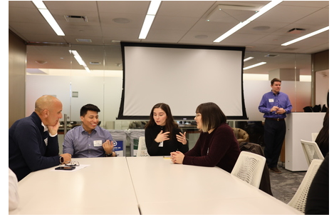
Lunch with ND alumni at NBC/Universal