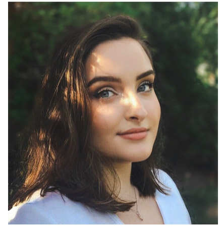
"Following the Unexpected Path: Fostering Flexibility and Grace" Fulbright Fellow, Masters in Education, Third Grade Teacher