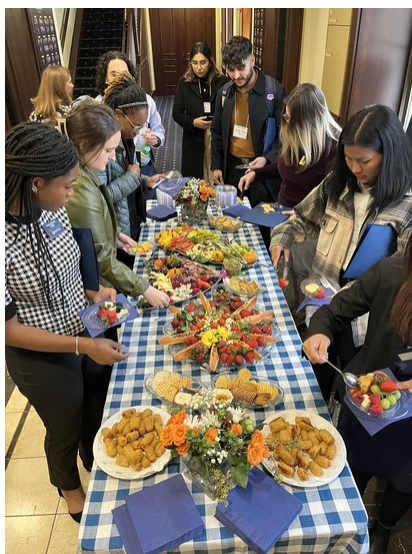
Delicious snacks in between Breakout Sessions.