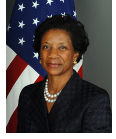
Keynote Address Former Ambassador to Trinidad and Tobago, CoFounder of the AN-Bryce Foundation